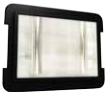
Visible flash module

It is necessary to turn the camera OFF, to remove the batteries and to wait 2 minutes before replacing the visible lighting flash module by the IR-35 infrared module. Simply raise the module with the fingers by the spaces designed for this purpose in order to remove it. Then, slowly reintegrate the replacement module by taking care not to damage the metal connectors at the back of the module.