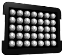
IR-35 IR infrared module